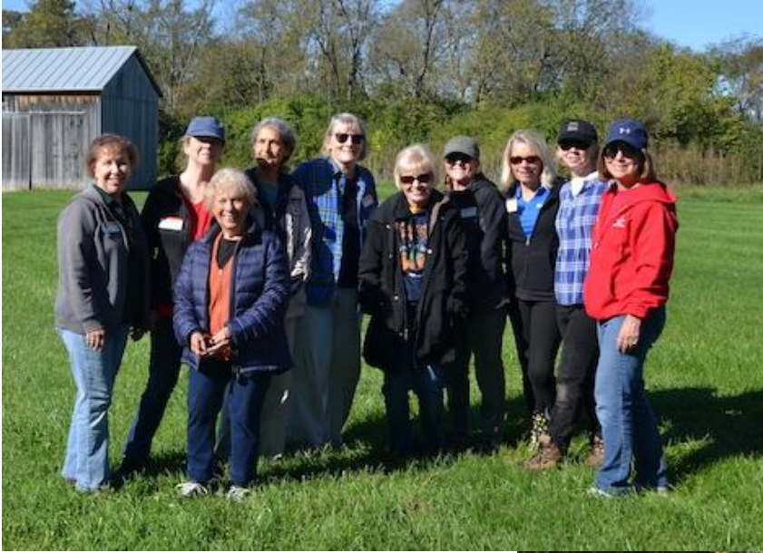
Chrisholm Founders Garden Workday