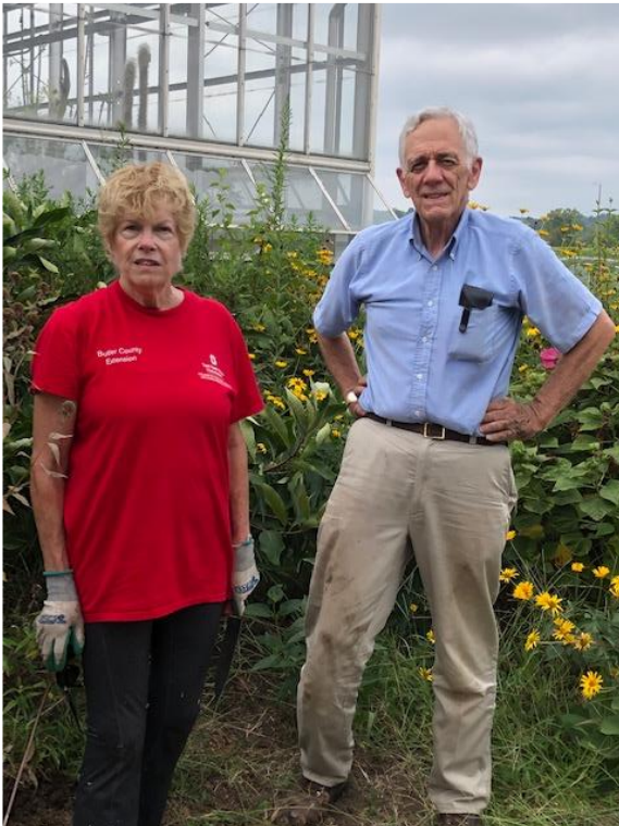
Volunteering at the Miami University Conservatory