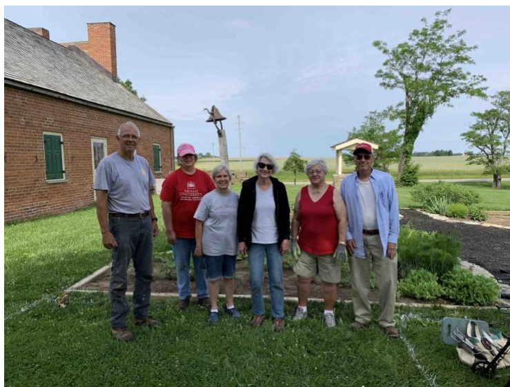
Some of the Doty Garden MGV volunteers.