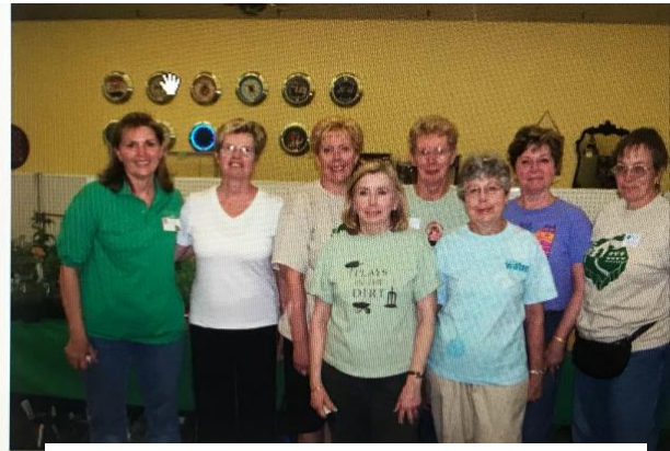
First MGV plant sale volunteers 2007.

I hope that we will continue to hold our plant sales as the years go on. Besides adding money to our treasury so we can make our meetings better, give scholarships to horticulture students, pay for plaques and markers to make the public aware of our projects, etc. our sale provides a large variety of healthy, inexpensive plants to all who attend. Our sale is a win-win for all participants. As the French would say (I have to warn you that I taught French for many, many years and just can't help adding little phrases in French when possible), Vive la Vente des Plantes, long live the plant sale.